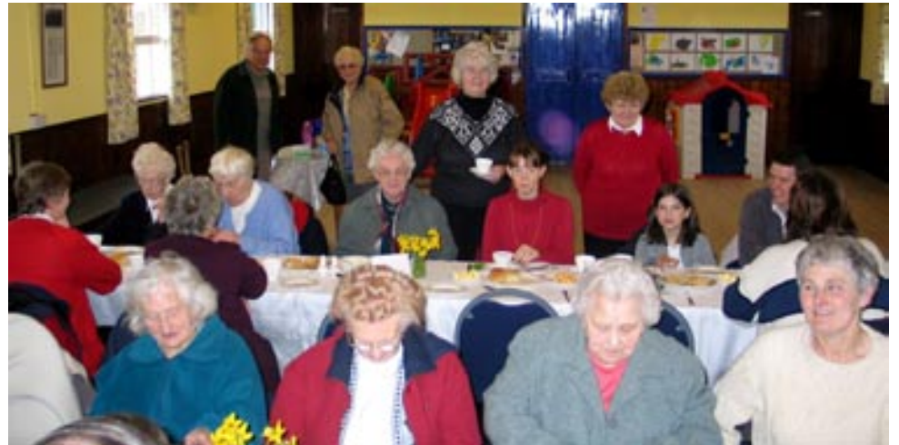
Parishioners and friends enjoying the popular Lent lunches in Holme St. Cuthberts Parish Hall