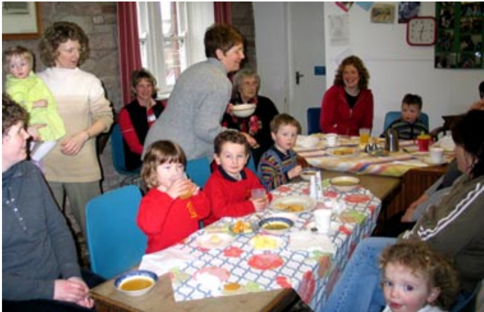
Serving Lent lunches to a happy band of young mums, children and grandparent in the ambulatory at Abbeytown.