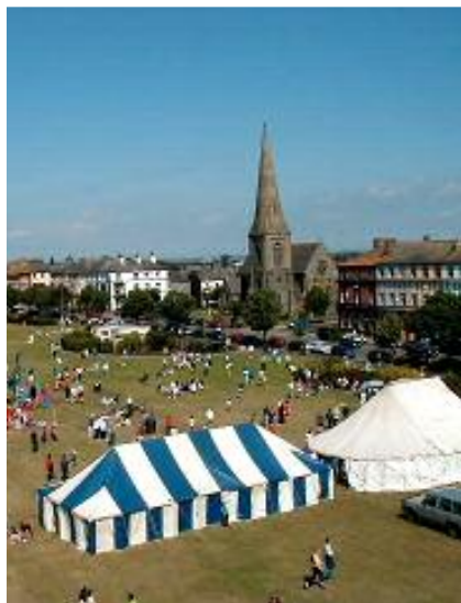
KITE FESTIVAL 2000