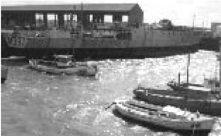
Above: HMS Chameleon after the storm, blocking the dock gates