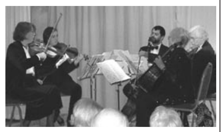
The audience listen with rapt attention

As an newcomer to this area, I am always amazed at the wonderful value for money available here for very high quality entertainment.