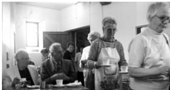
Abbeystown Strawberry Teas & Exhibition in Abbey in aid of Church Fund