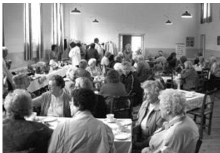
Strawberry Teas in St Andrews hall held by Silloth & District Pensioners Association