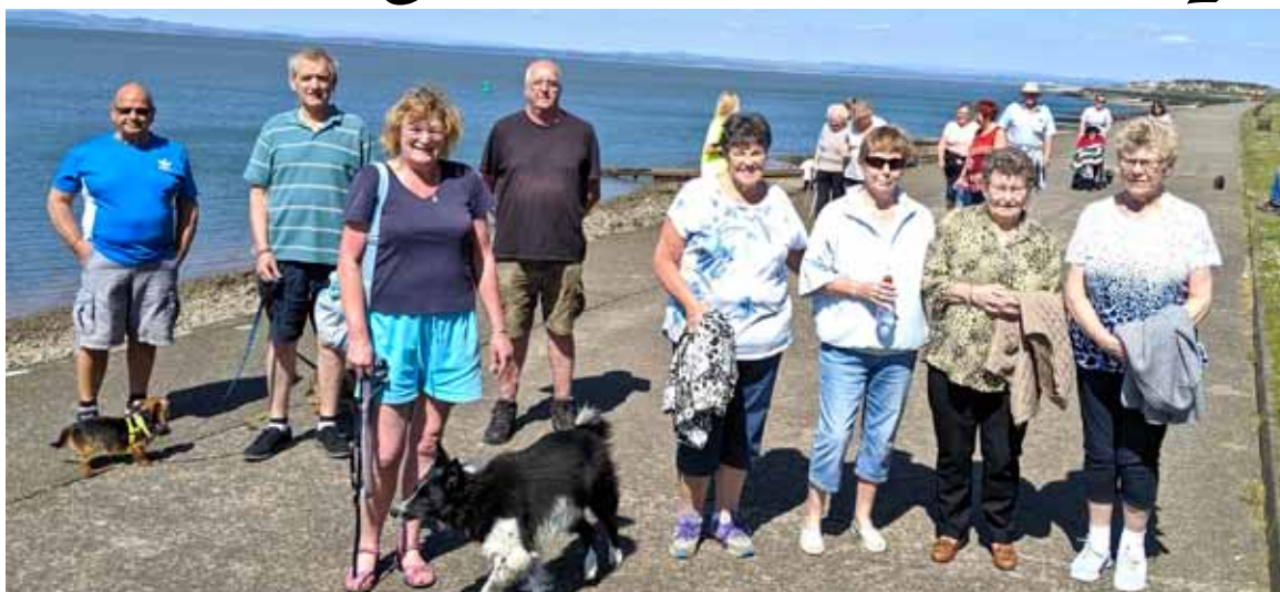
Why not go along to the next Walking for Health Group walk on Thursday 8th September at 2pm. You know it can only do you good!