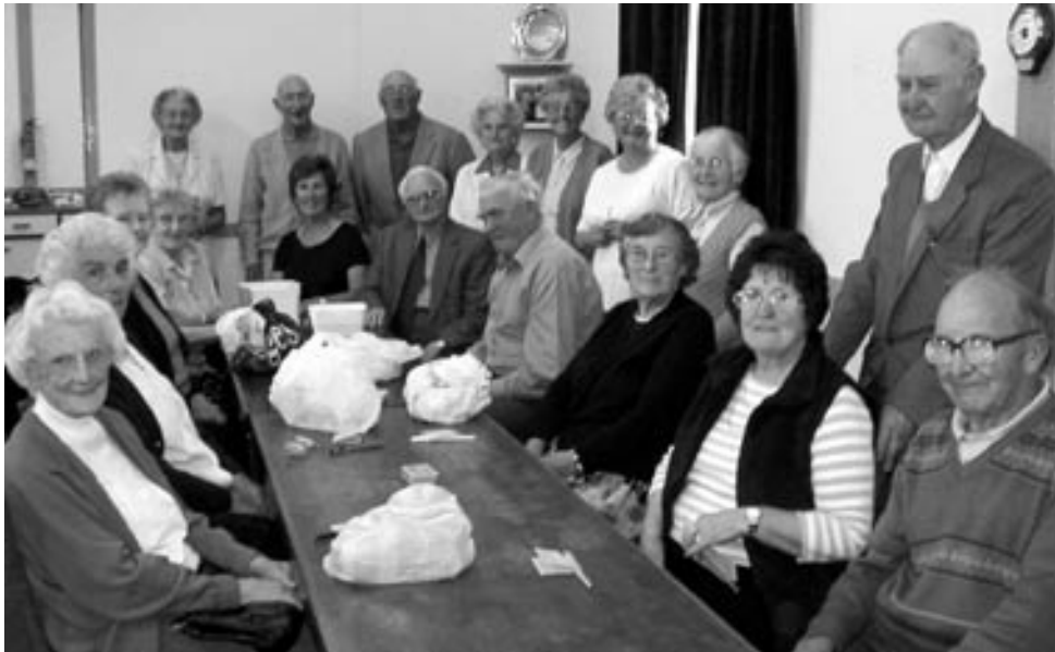
Members of Silloth & District Pensioners Association

On Thursday 17th June in the Recreation Hall, Eden St. A "Bag Whist Drive" with a Buffet Supper was held, what a good night everyone had, all going home with four prizes, some rubbish and some excellent depending how well you scored.