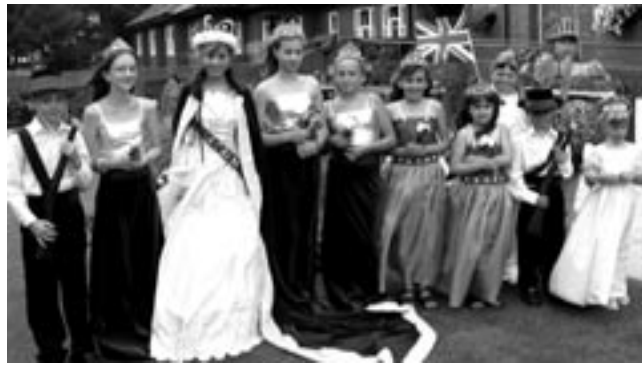
Carnival Photos courtesy of: Bill & Winifred Allen