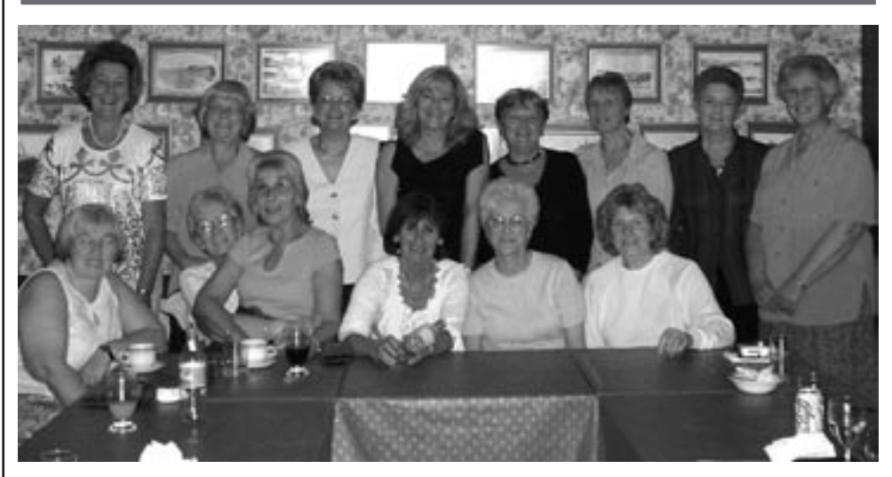
Gathering of friends from School etc. who travelled from as far as Switzerland and the USA meeting in the Golf Hotel.