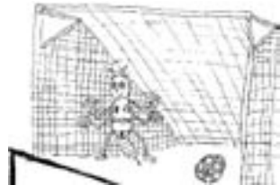
Goalie Bee by Ashley Little aged 8 from