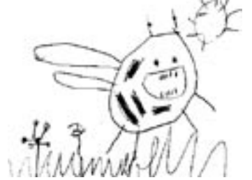
Ben the Smiley Bee by Peyton Minnican aged 4 from Silloth Primary School

It's snowing, and the flakes are falling Like cherry blossom from a thousand orchids. The air, crystal and breath- clouded Sharpens with it's stillness The crisp crunch of footsteps On the grey-shadowed mantle. Across the palings, beyond the glassed pool The crows perch, spectre-like and black Against the misty downward- moving backdrop. A handclap rings into the still space And the birds rise up flustered and fluttering. But the white petals fall and fall - Each one to its own haven On wall, leaf, branch, shoulder and hatbrim. The countryside sleeps again As the gentle particled blanket shrouds it's realms.