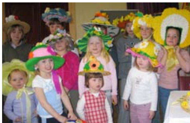
Children showing off their bonnets in the Church

The winner of the colouring competitions for the Pebbles and