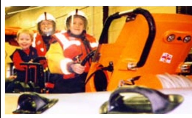
Lifeboat Station welcomes children from the TOPO Holiday Club