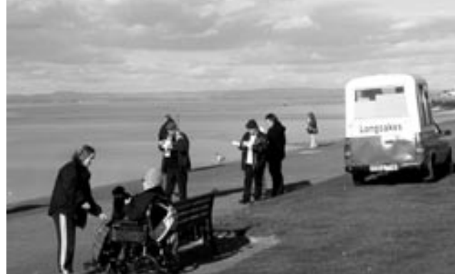
Enjoying Longcakes ice creams on Silloth Promenade this April

There are lots of things happening around here. Please let the Solway Buzz know what is going on. We want lots more reports and pictures, please help us to help you.