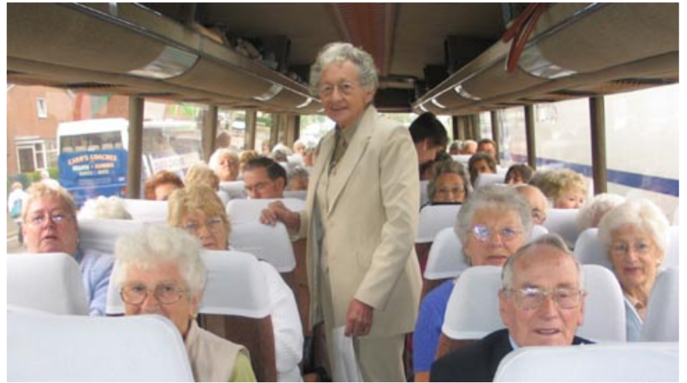
Silloth & District Pensioners all ready to go to York on their annual summer trip