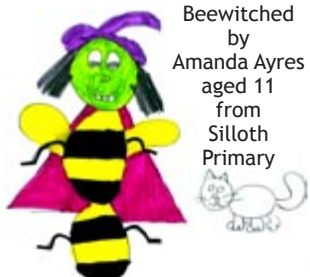
Beewitched by Amanda Ayres aged 11 from Silloth Primary