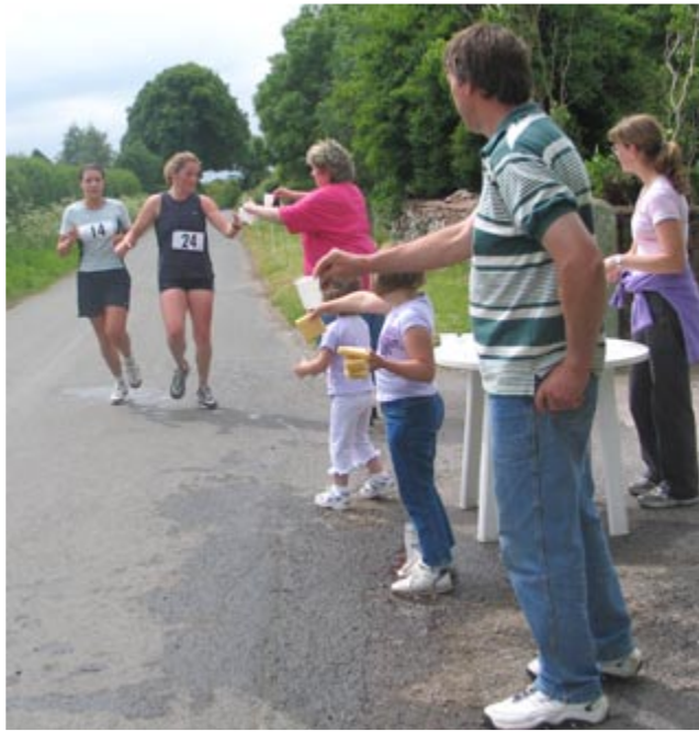
Volunteers providing much needed water at High Laws