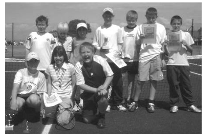
Our young tennis players thrive on competition