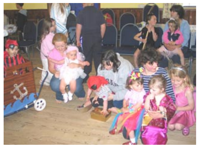
There's fun for all ages in Holme St. Cuthbert Church Hall