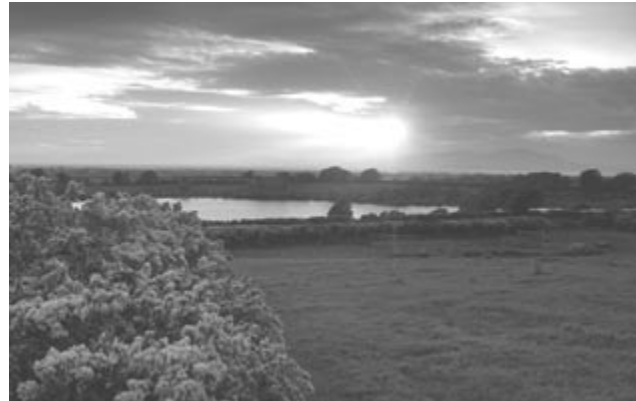
Sunset at the Solfest site at the Tarns

Cumbria's most eagerly awaited, and ambitious music event of the year, SOLFEST, is already creating a stir nationally and internationally.