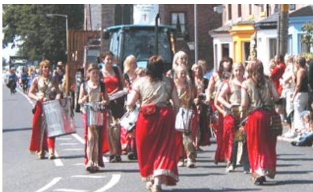
Below: Abba Can Can team Above: Steel Band