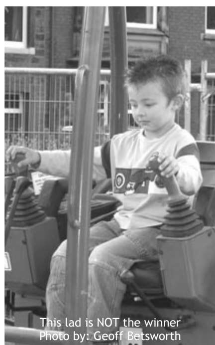
This lad is NOT the winner

Those who attended the Carnival will have seen the Rotary "test your skill" mini digger attraction. The idea was to place a tennis ball (which was suspended from the jib of the machine on a length of string) on top of a traffic cone.