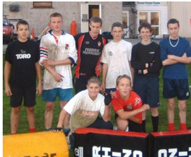
Eight of the Squad taking a rest