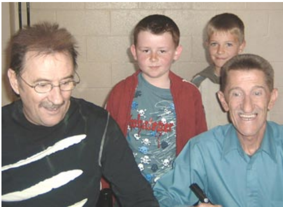
Silloths Chuckle Brothers finally get to meet the real ones

Silloths' own Chuckle Brothers met the real thing one Sunday night at the Sands Centre, Carlisle.