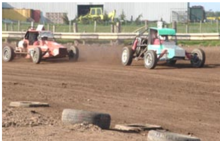
YD117 hot on the heels of SL5

Sponsored by Autograss Review "the magazine for National Autograss Racing". The stock hatch class was introduced to allow a cheap entry into Autograss racing where all the cars use standard parts off the shelf. With the cars being almost standard means that you will see very close racing in this class. So far we have 25 men and four women entered.