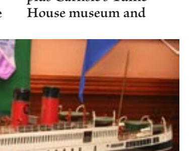
One of the many items on display

this ever-growing port archive, many residents and shipping enthusiasts, in and around Silloth, plus Carlisle's Tullie