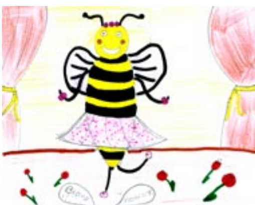
Ballet Bee by Aimee Gray aged 11 from Silloth Primary School