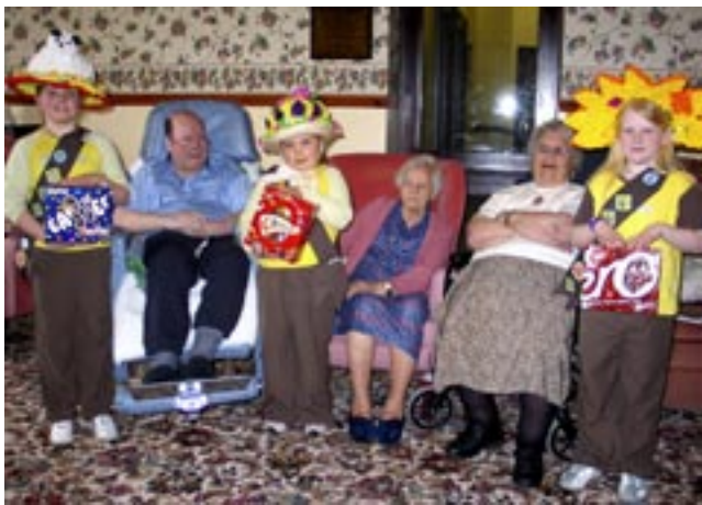
Above: The Brownies showing off their Easter Bonnets Left: The Winners, Below: The Brownies with some of the Nursing Home Residents