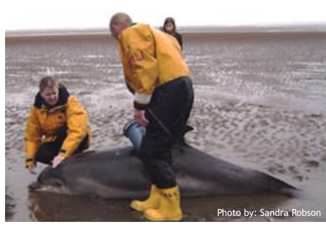
More pictures and story on page 8