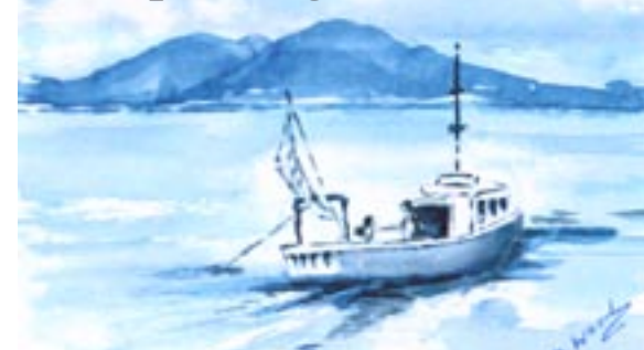
Sponsored by Solway Arts & STAG Local artists will be displaying work in acrylic, water colour and oil mediums