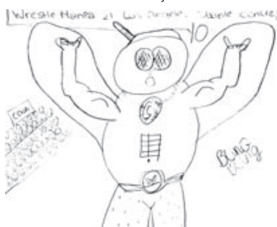
Cena Bee by Billy Charters aged 10 from Silloth Primary School