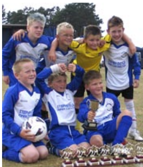
5-a-side Winners from Seaton