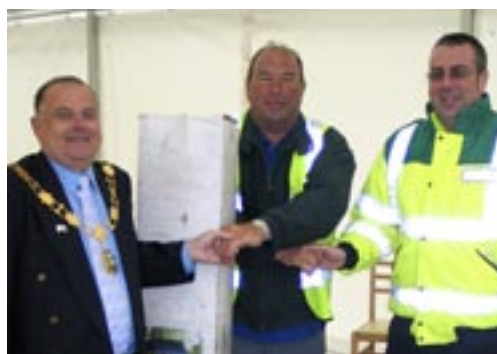
Presented a Gazebo to the First Responders