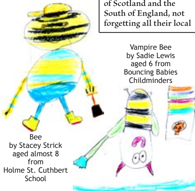
Vampire Bee by Sadie Lewis aged 6 from Bouncing Babies Childminders

After the terrible fire at Holm Cultram Abbey, a good crowd turned out to enjoy the Strawberry Teas in marquees in the Abbey grounds