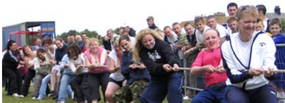
Tug-o-War Winners - Cumberland Inn Ladies