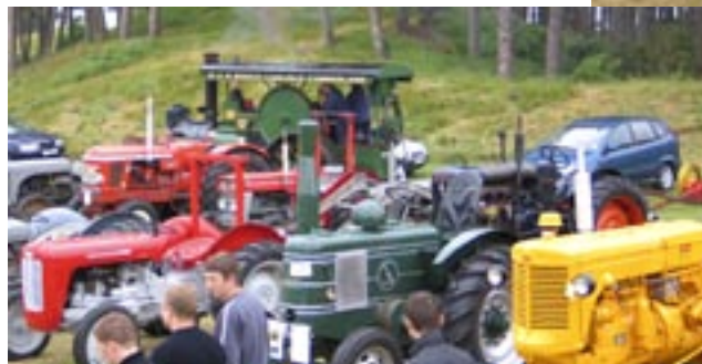
Above Left: A wonderful display of Vintage Tractors with a Steam Engine passing by behind them