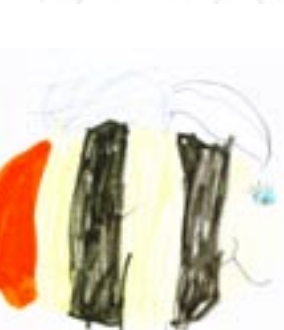
Easter Bee by Hollie Lewis aged 9 from Bouncing Babies Childminder