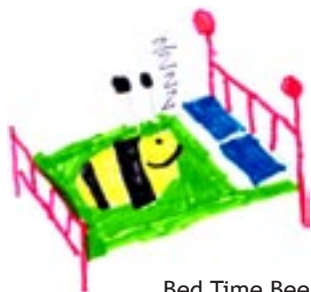
Bed Time Bee by Rachel Thornton aged 7 from Stockton-on-Tees

We feel very strongly that all our beds must remain where they are and be fully utilized. We're willing to discuss any other changes which would be beneficial.