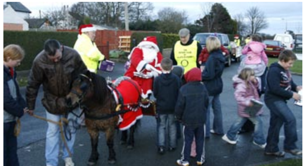
Children came out from Morcambe Park to meet Santa and his pony