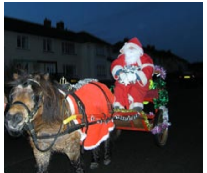
The pony decided Santa can have his deer back for 2007

"helpers" would like to thank the good people of the town who turn out with trays of mince pies and various warming beverages.