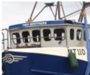
Page 6 Two Brothers Launched