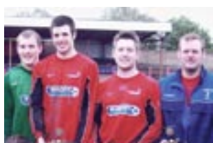
Page 15 Silloth Football Club