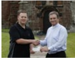
Page 2 Skydiving for Abbey