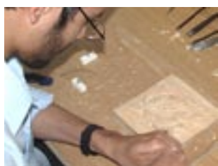
Page 8 Woodcarving Group