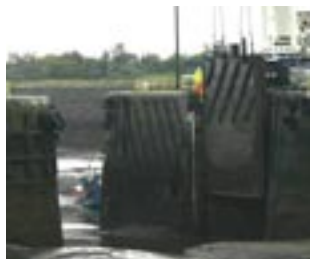
Page 3 Dock Gate Refitting