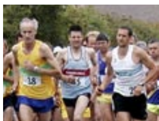
Page 9 Abbeytown Road Race