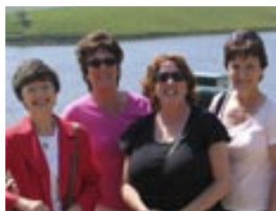
Page 7 Pensioners Outing