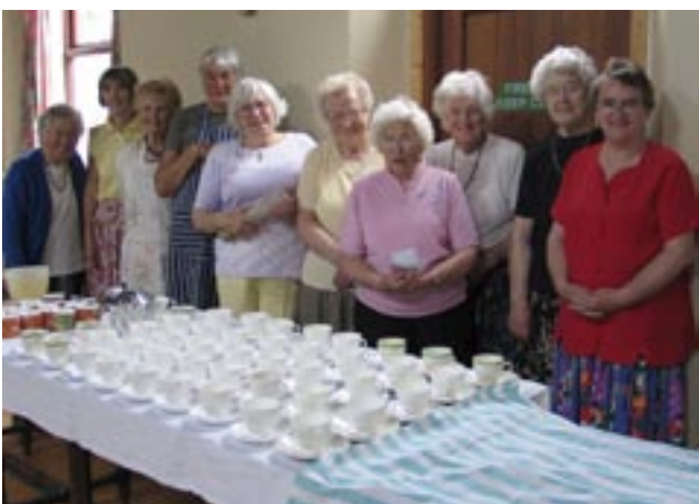
The indispensable tea ladies were very appreciated