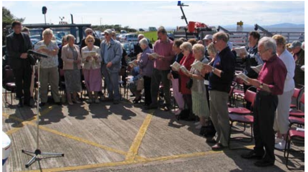
There was a good turnout for the annual sailors service at Silloth Lifeboat Station