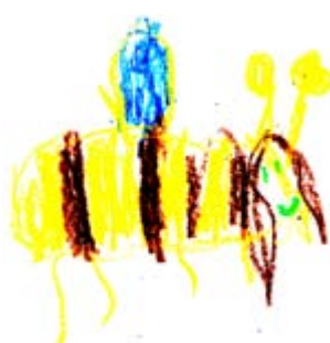
Flutterby Bee by Lucie Gordon aged 9 staying at Solway Holiday Village

Visit: Your local branch Phone: 0845 601 8396 Click: www.cumberland.co.uk Cumberland House, Castle Street, Carlisle, CA3 8RX