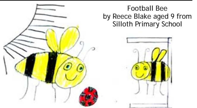
Football Bee by Reece Blake aged 9 from Silloth Primary School

The lads enjoyed their fishing course and are busy planning their next excursion to try their luck elsewhere.