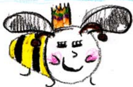
Princess Peach Bee by a visitor to the Discovery Centre

The PRide Awards is the only awards scheme showcasing the best PR work being carried out across the UK regions and nations. There were 1,456 entries this year.