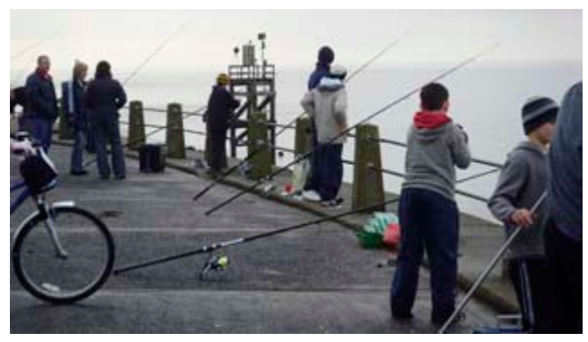
Competitors on the Sea Wall