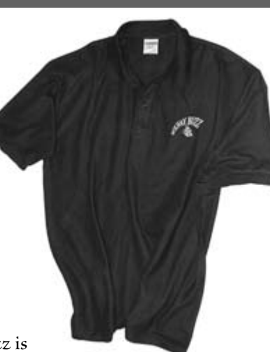
Masthead Bee Winner

So, come on kids, get drawing, the Buzz is always looking for more imaginative bees and yours might be the next winner. Send them in to the address on this page and a quality Solway Buzz embroidered sports shirt from Carlisle Embroidery could be yours.