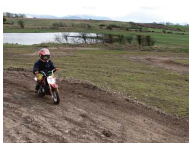
A six year old burning up the juvenile course