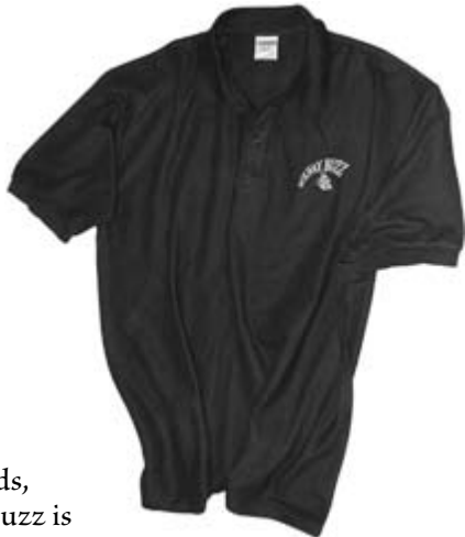
Masthead Bee Winner

So, come on kids, get drawing, the Buzz is always looking for more imaginative bees and yours might be the next winner. Send them in to the address on this page and a quality Solway Buzz embroidered sports shirt from Carlisle Embroidery could be yours.