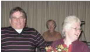
Page 3 Fundraising in Mawbray