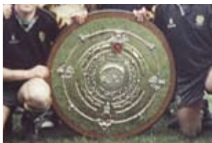
Page 15 Silloth win the Shield