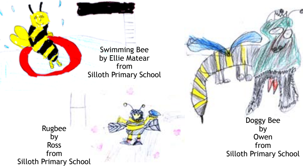
Swimming Bee by Ellie Matear from Silloth Primary School

The evening was brought to an end by a tongue in cheek version of Cinderella where all the cast sat on chairs and just stood to give practically a one line version of the pantomime Cinderella. The cast were all members of Causewayhead W.I.