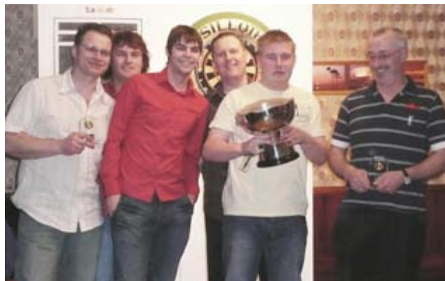
Michael Wilson Memorial Trophy Winners