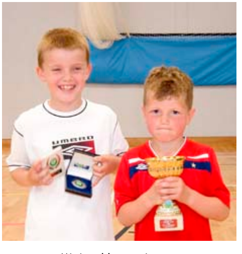
Mini red boys winners