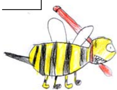
Dog Bee by Callum Pearson from Silloth Primary School