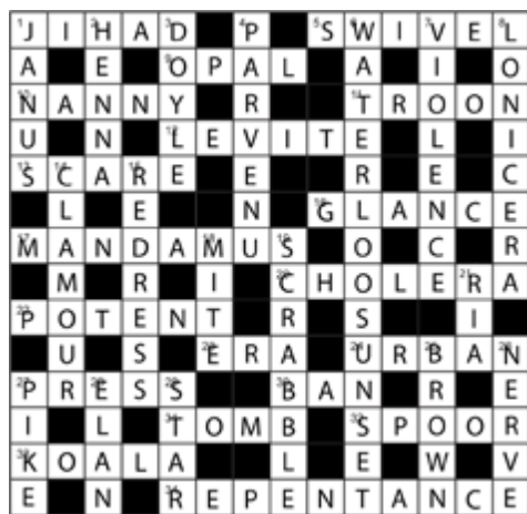
Answer to issue 69 crossword

The first correct entry drawn will receive a bottle of wine or, if under 18 a Solway Buzz polo shirt.